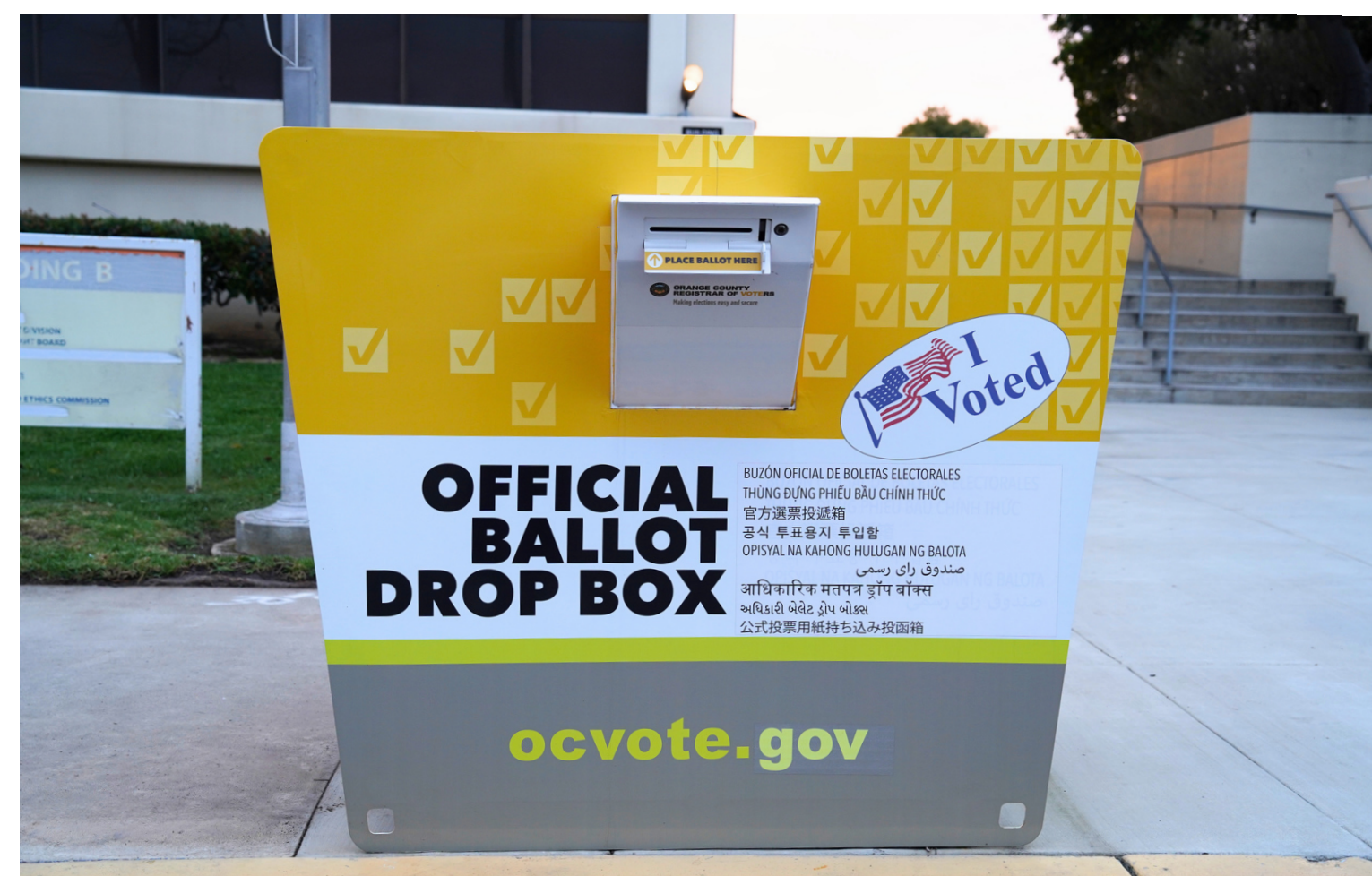
Ballot dropoff box outside the Orange County Registrar of Voters.

The FBI is investigating how a wave of racist text messages were sent to people the after Tuesday's day election. Some of these texts, sent to some California residents included the persons' actual name, and based on their racewould say for the recipient to prepare themself for deportation or enslavement.