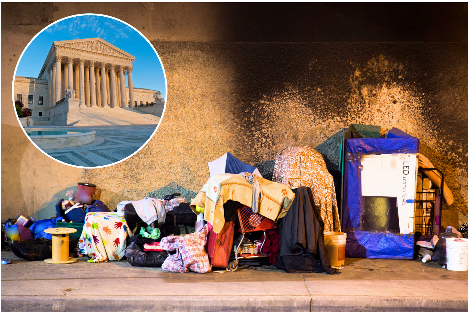
A homeless encampment in Los Angeles.; Supreme Court

The Orange County Registrar of Voters are still counting ballots that were mailed back the day of the election last week. Over 80,000 ballots are still left to be processed, with a significant portion of ballots being signature-verified. The Santano has projected Measure G to fail, city council-member races, SAUSD area one are too close.